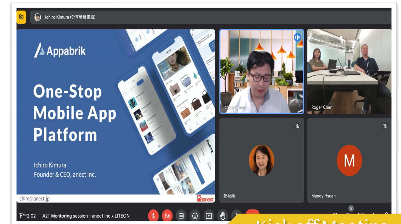
Kick off Meeting